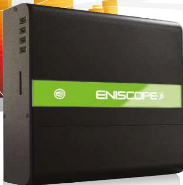
8 - CHANNEL